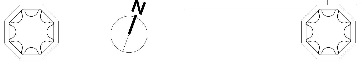
proposed ground floor plan